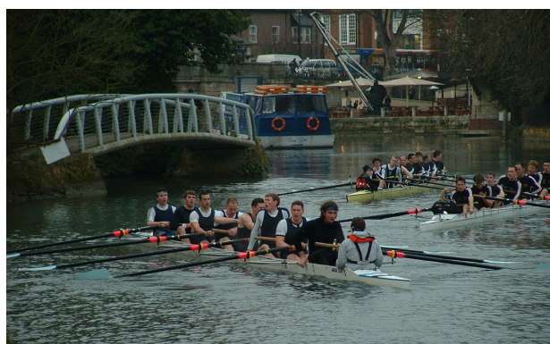
The Men’s 1st Torpid, after rowing over on Thursday.