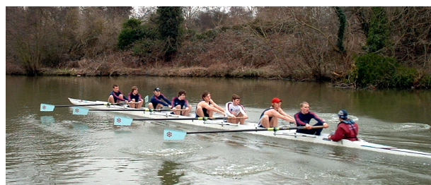
The Men's 1st Torpid racing in the Isis Winter League.

Another term, another frustrating state of affairs with the state of the river in Oxford. It was with great disappointment we bore witness to the cancellation of each successive day of Torpids before our boats could reach the bung lines. Thus the headship for the girls will have to wait for one more year, while the men's rapid rise through Division I also took a temporary reprieve.