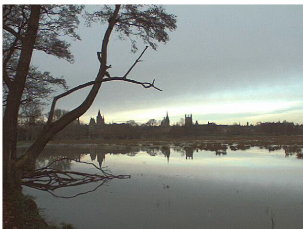
The view across a flooded Christ Church meadow. A few more inches, maybe some buoys, and I think we'll have ourselves an alternative rowing venue.

There are recollections of events of 40 years ago (which the more delicate reader may wish to avoid) and news from alumni of that period, while a contemporary, Leslie Singleton, has been piecing together some old programmes.