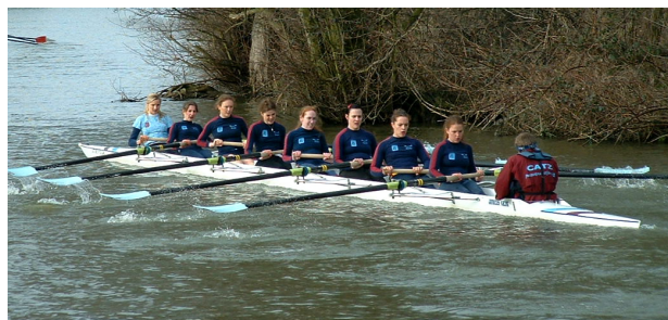
The Women's 1st Torpid racing in the Isis Winter League at the start of 6th Week.

This term has not been an easy one, but whenever the club was given the opportunity, it really shone. It all started with a week's training camp before term started, during which we were unable to get on the water at all, we worked hard on our fitness and the girls really started to bond as a team. The term was a matter as doing the most we could when the weather was on our side, and when the rain came we did many circuits and weights sessions.