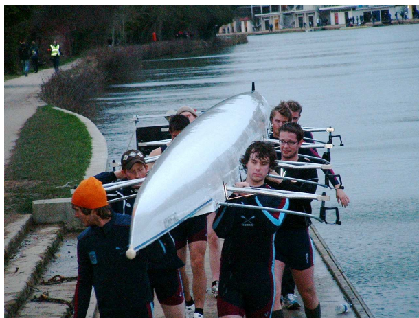
The Men's 1st Torpid after Thursday's racing.

ability that the rowing squads possess, with novice and senior rowers alike showing great commitment, development and skill throughout the term. With the rapid improvements shown by the crews as well as the extra depth which will join us over Trinity term, I am expecting the same success for Summer Eights. I have no doubt that we will be able to claim back the positions that were taken from us last year.