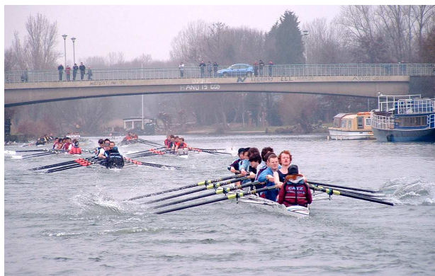
The Men's 2nd Torpid racing on the Wednesday.

We had organised a weekend training camp in London, which proved to be very beneficial for both the men and women's first squads, allowing us to get the water time that had been so sorely lacking up until that point. After that weekend, we were able to get out onto the Isis, and water-based training began (albeit still controlled by the rather erratic flag status) and both the men's squads were able to gain the water experience needed to compete in Torpids.