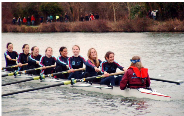
The Women's 1st Torpid after rowing over as Head of the River on Saturday.

With Torpids over all eyes and training turned to Summer Eights and the possibility of crossed blades! The Women are hoping to enter 3 crews for Eights and continue the successful path we have started on.