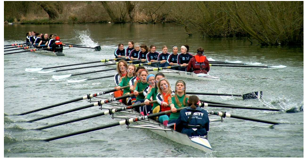
The Women's 3rd Torpid (centre) in the thick of it on the Saturday . . .

Term began well with many girls from both the first and second boats attending a training camp in 0th week. It was great to have 12 girls competing for seats in the 1st VIII. Crews were finally decided and, for the first time in a long while [1996], Catz women had 3 boats set to enter Torpids. Unfortunately, though, the onset of snow meant we were forced to turn to ergs, circuits, weights and more ergs along with some giant snowman building. Despite the weather and limited water time one Isis Winter League race went ahead which all three crews took advantage of. The 2nd and 3rd VIIIs recorded some respectable times whilst the 1st VIII continued their winning streak! With the flag continuing to limit training and Torpids less than two weeks away the 1st VIII went to a completely deserted Dorney Lake for a hard but successful day of training. We all had to make the most of the water time on the Isis with the flag only dropping to Amber less than a week before Torpids. Despite this both the 2nd and 3rd VIIIs set some