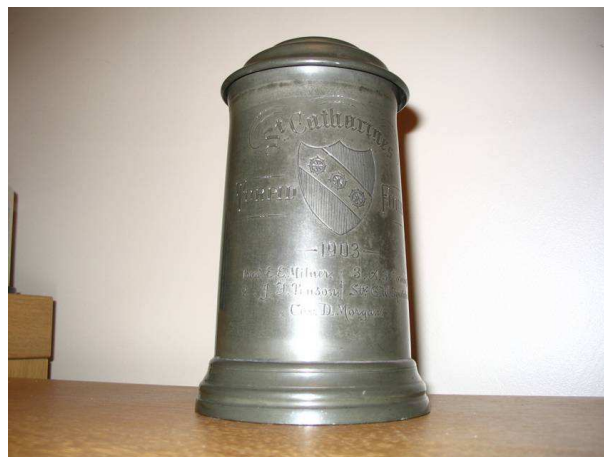
The 1903 Torpids Four tankard