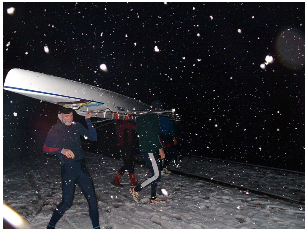
What were you doing at 7am on Friday, 6th Feb 2009? I bet you weren't having as much fun as this.