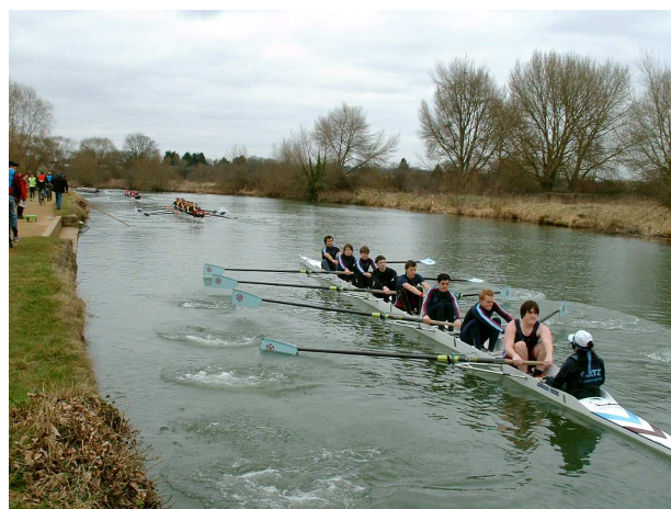
The Men's 2nd Torpid starting on the Saturday.

The 2nd boat, being the top of Div 6, were tasked with reclaiming Catz' position in the fixed divisions above. On the first day they were able to outpace the Magdalen crew behind them, but unfortunately were hit with a case of the crabs in the second race so failed to catch Regent's. Spurred on by the thought of having to row twice three days running (and feeling fresher after their first race was klaxoned midway through) M2 proceeded to overbump Linacre on Thursday, followed by Hertford on Friday, after being bumped by a rapid Wolfson crew, and finally overbumping St Benet's and Brasenose after some mid-Gut carnage!