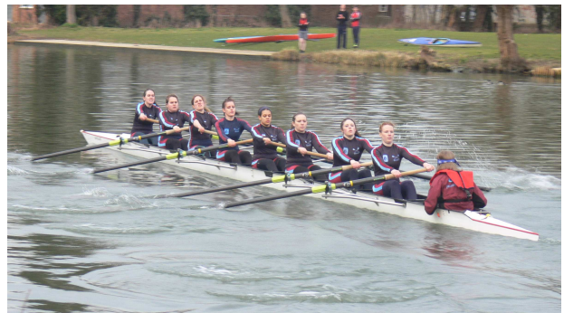
. . . while the Women's 1st Torpid had a slightly more relaxed time rowing over Head of Div I each day.

With Torpids over we're now focussing on training for Summer Eights and the chance to finally bump some crews and the possibility of more blades! I'm expecting the women to be entering three VIIIs and we very much hope to build on the successes that we enjoyed this term!