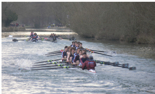
Men's 1st Torpid closing for the bump on the Thursday