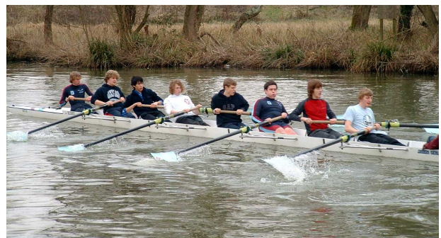
Finally out on the water, the Men's 2nd VIII on the Isis yesterday. Only 24 more training-days to Torpids. . .

For those who have scanned the menu in detail, I am assured that the dessert is actually a 'Mousse' and not a 'Mouse'. Having recently returned from a gastronomically adventurous week in France, I can't help feeling a bit disappointed.