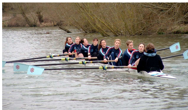
The Catz Women's VIII racing in today's IWL.