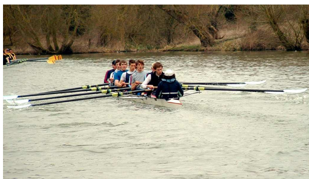
Catz Men's 'C' racing in today's IWL.

These days, Torpids consists of 6 men's and 5 women's division, with crews in the lowest division having to qualify in the Rowing On races held on the preceding Friday. Last year both our 2nd boats had to Row On. The men's 2nd went on to successfully re-establish themselves in the fixed divisions but the women's 2nd Torpid had a bit of a nightmare, dropping 8 places. Fortunately the women's 3rd Torpid fared rather better, finishing 2nd in Div V. So, if they qualify, this year's Women's 2nd Torpid will inherit that place with another chance of returning the fixed divisions. The last time a Catz Men's 3rd Torpid actually succeeded in Rowing On was in 1998, so that's their only goal. There's not even a rumour of a women's 3rd boat at this point.