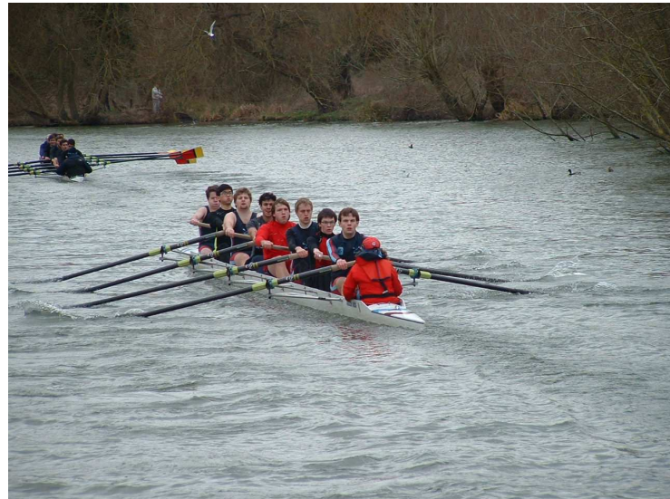
The Men's 2nd VIII rowing in the IWL C.

The women are chasing Wadham and being chased Oriel. Wadham were faster than Catz in IWL B and Oriel slower in IWL C so it could be a quiet first day, just to settle the nerves. Magdalen start Head but they haven't raced since IWL A when they were 2 seconds slower than Catz, and S.E.H. who start 2nd, don't seem to have raced at all. Perhaps it's going to be Wadham's year.