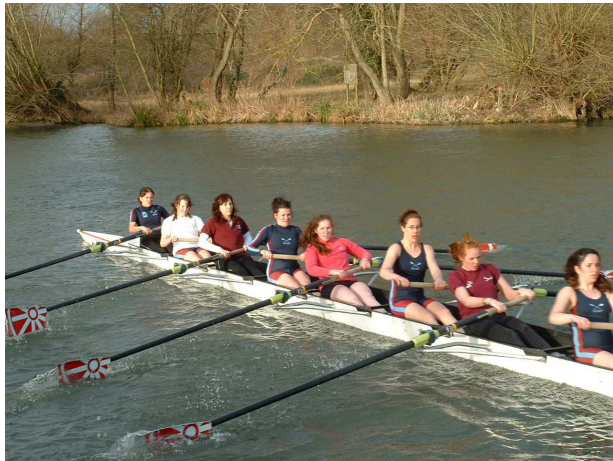
The Women's 1st VIII rowing in the IWL C.

They've been using it since the start of term and, by all accounts, are delighted with it but the cox will be even happier once we fit a rudder designed for steering round corners rather than keeping the boat straight down a 2000 m course. At some point we hope to have an official naming ceremony but first we'll need a name — we await the Boat Club's decision on that.