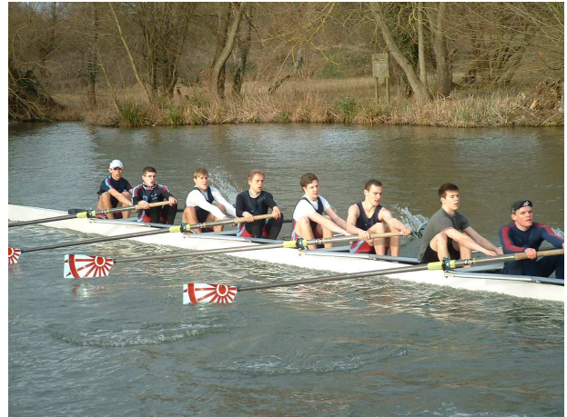
The Men's 1st VIII, rowing as Catz C, in the IWL C.