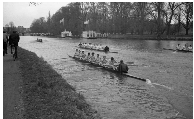
The 1968 St Catherine's 2nd Torpid (middle lane) approaching the finishing line.