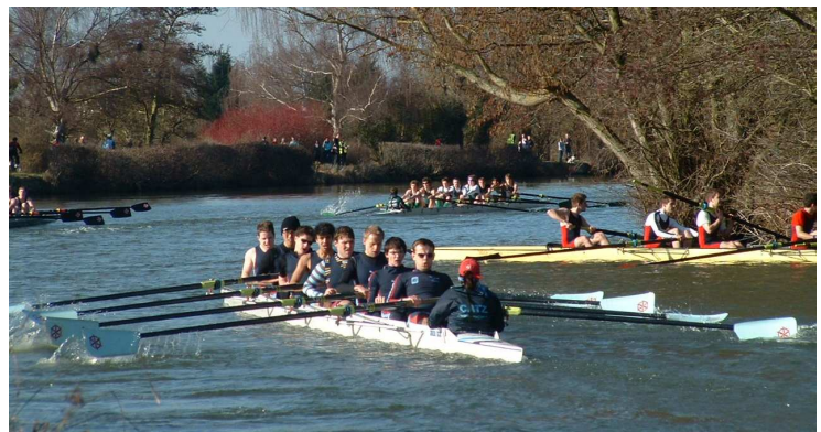
The Men's 2nd Torpid racing on the Saturday.

since 1998 that we have had a men's third boat qualify for Torpids, and they have set a good standard to act as a target and to be built on for next year.