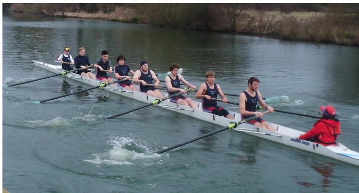
The Men's 3rd Torpid racing on the Thursday.

Despite the disappointment for the first boat, we still have many successes to celebrate. The second