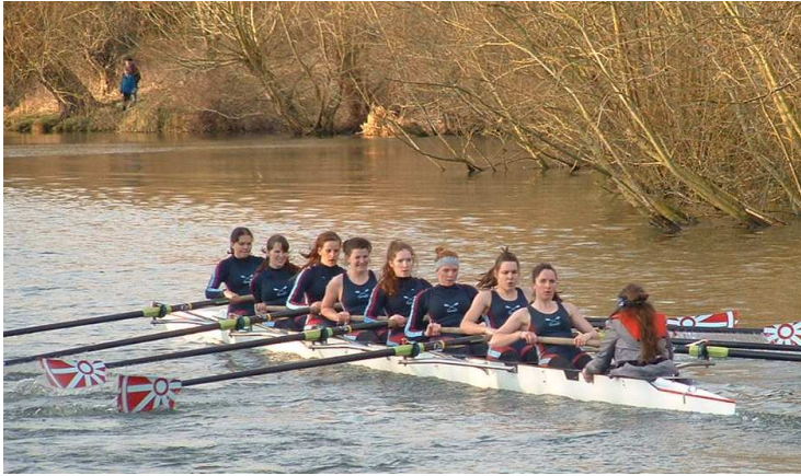
The women's 1st Torpid racing on the Thursday.