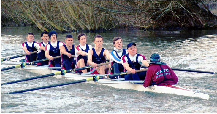
The Men's 1st Torpid racing on the Thursday.