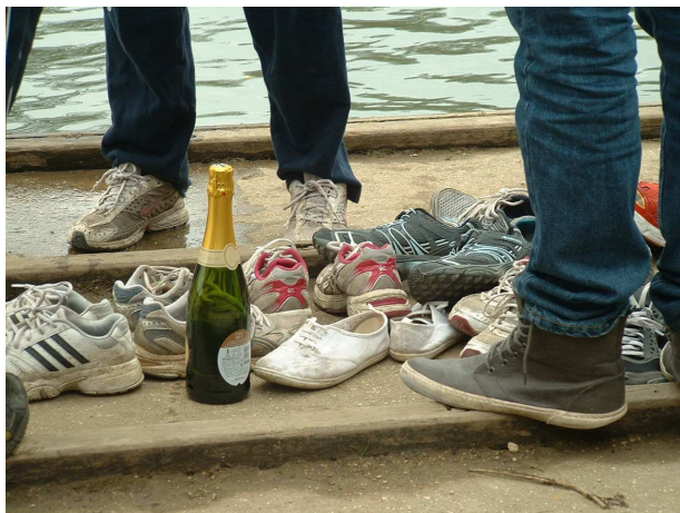
It looks like somebody's expecting a happy landing.