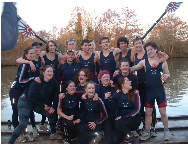
The Men's and Women's 1st Torpids