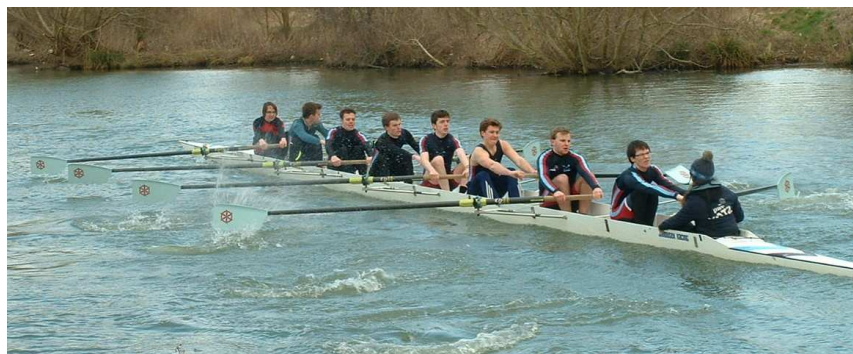
The Men's 2nd Torpid start their campaign