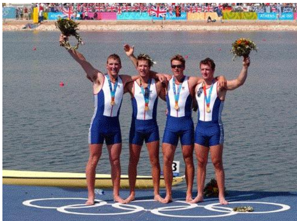
The GB IV at the medal ceremony. Apparently the rendition of the National Anthem by certain members of the crew was so awful as to move even a big man to tears.

There has been some debate about whether the GB four were lucky to win on the surge of the stroke, but, having rewatched it on video, it seems to me that the crews crossed the line at the parts of the stroke which gave any advantage to the Canadians.