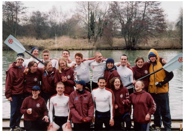
Members of the successful 2001 Catz 1st Torpids

The upward progress of the 1st boats continued in Eights, although in less spectacular fashion. Even so the women's 1st Eight gained a couple of places to finish 2nd on the river, equalling their highest ever position while the men also gained a couple of places to finish 10th in Div 1, their highest summer position since 1883. But while all was going well at the top end, the lower crews fared less well; an ominous sign, perhaps, of things to come.