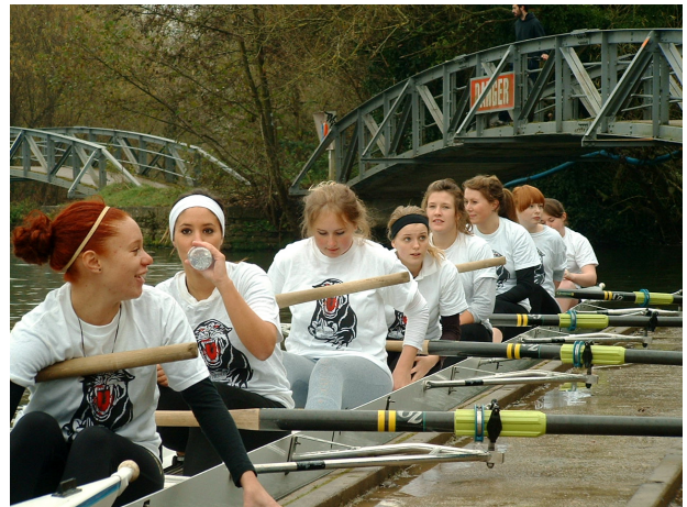
The Catz Women's Novice VIII about to race in Nephthys Regatta

The new 'University College Boathouse', on the site of the former OUBC. It might be something to do with the resemblance to the retail outlets on Botley road, but I keep thinking 'Boats R Us'. Meanwhile OUBC, along with the other University squads, have decamped to a new boathouse in Wallingford.