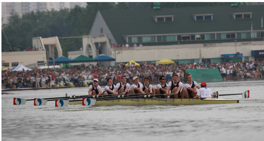
St Catherine's competing at the STX Regatta.

Top Gear! 2 This was soon apparent when we became local celebrities and began to be recognised everywhere we went, getting stopped every few minutes to pose for photos with fans!