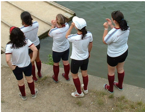
Anxious moments on the Friday of Eights as members of the Women's 2nd Eight watch their male counterparts fighting to hold off Worcester II (see under 'Results').