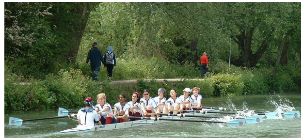
The Women's 2nd Eight who gained two places making them not only Catz most successful crew of the week but the most successful crew of the past two years.