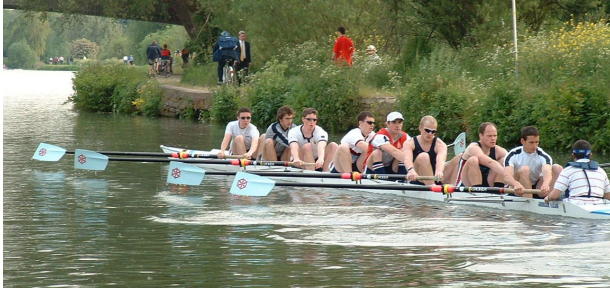
The Men's 1st Eight warming up on Thursday (no, that's just the way the boat's rigged!).