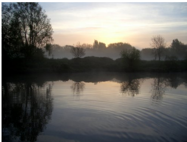
Sunrise over the Isis. One of the joys of summer rowing is how ridiculously early in the morning it is possible to find yourself down at the boathouse. (but I was coaching that outing).