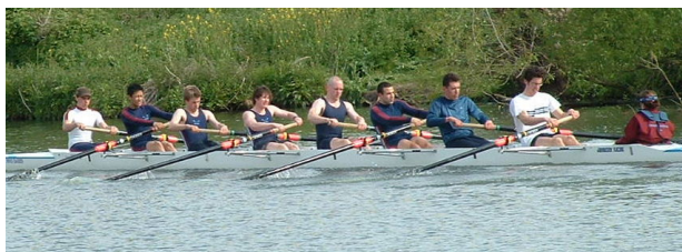
The Men's 1st Eight.

Hopes of reinforcing the successful Men's 1st Torpid with our Blues and Isis rowers for the summer took an early nosedive when someone realised that the first round of the Rowing World Cup, at Dorney Lake, was the same week as Eights. Further depredations due to injuries and examinations have meant our 1st Eights are now combinations of the 1st/2nd Torpids and it's been a struggle to get even 2nd Eights together to fill our 'fixed' places. These are the crews that were officially entered, although judging by the photos from this morning's training there have been a few changes since then.