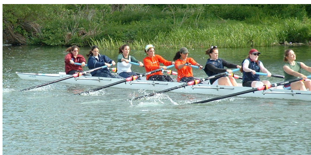
The Women's 1st Eight