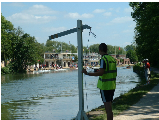
The Eights finish line — only crossed by 5 Catz crews in 20 starts. That's not necessarily a bad statistic, except that this year it was.

Sixty years ago when, no doubt, we had proper summers, the post-war resurgence of student numbers led to Catz boating their first ever 3rd Eight, although it is unlikely that those pioneers would have anticipated the colourful appearance of their modern-day successors. Delving still further back into our history, we were contacted by the great-niece of a former St Catherine's oarsman who suggested he might be one of the 'missing' captains from the mid-1930s and she has responded to my request for more information on this character.