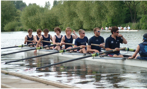
The Men's 1st Eight on Thursday.

It was an eventful week of bumps in the end. Comparisons with last year were unavoidable before racing kicked off, but each crew knew they would be rowing on their own terms after the difficulties faced all year. In the end it became a process of consolidation for most of the boats, M1 and M2 placed high in their respective divisions faced a lot of strong boats between them, while M3 having qualified with relative ease, would still enjoy a battle with Keble through the week.