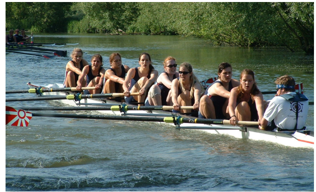
The Women's 1st Eight on Thursday.