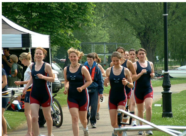
The women's 1st Eight warming up at Bedford Regatta.