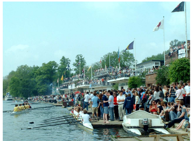
The boathouses on the Saturday of Eights.