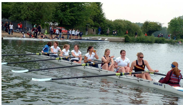
The women's 2nd Eight after bumping on the Friday.