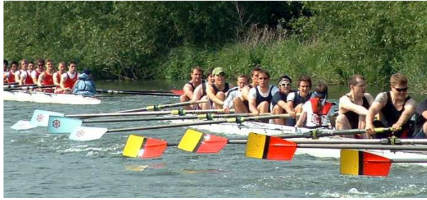
The men's 2nd Eight being hard-pressed by St Antony's on Wednesday — they escaped and ended up rowing over all four days

By the time Summer Eights arrived, we were able to field four men's VIIIs, including the beer boat. Unfortunately, M4 did not qualify (but seemed to enjoy themselves immensely), and M3 had a tie with Hugh's M3 for the last qualifying place. A side by side race was deemed the only fair decider, and Catz M3 dominated, taking over 3 lengths during the course of the race. Unfortunately, that was the most successful race of Summer Eights for M3, who had four days of tough racing against much more experienced crews. M2 held their place, racing exceptionally well, coming close to bumping on several of the days. M1 were able to bump Keble rapidly off the start on Wednesday, resulting in a chase for Univ each day after. We were unfortunately unable to catch them during Summer Eights, but managed to hold off a very fast Hertford Boat, moving up once place overall.