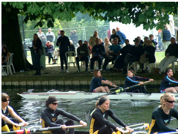
Tight racing at Bedford Regatta as Catz women (far side) beat Anglia-Ruskin. Losing finalists last year, this year Catz went one better: they lost in two finals.