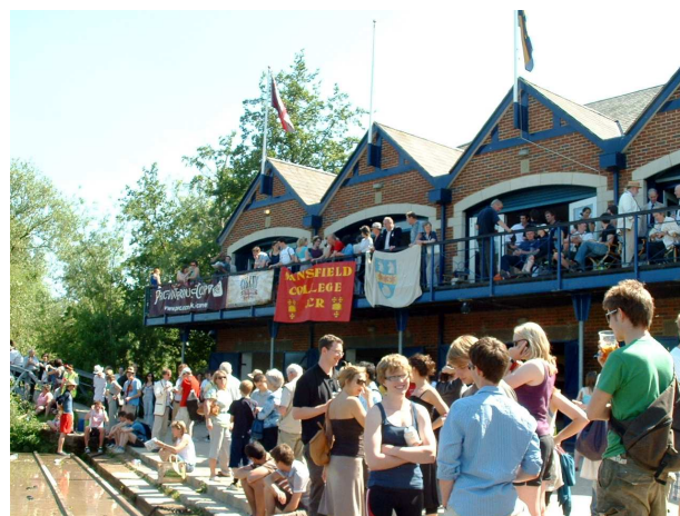
The Long Bridges Boathouse on the Saturday of last Summer Eights.

In planning terms it would be useful to know numbers by 19 May.