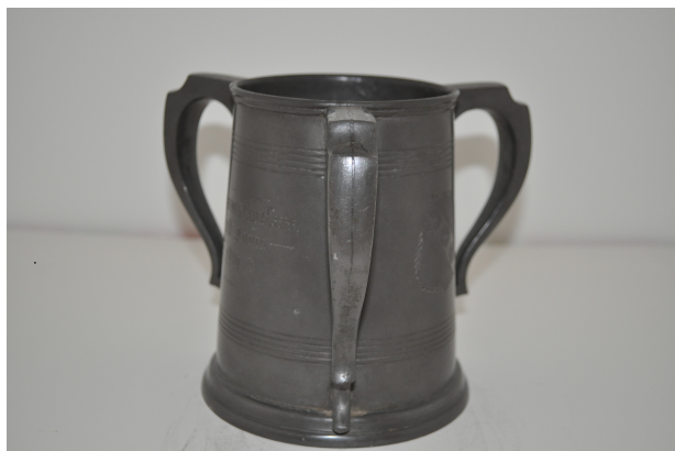
A 1901 St Catherine’s Torpids Fours tankard.