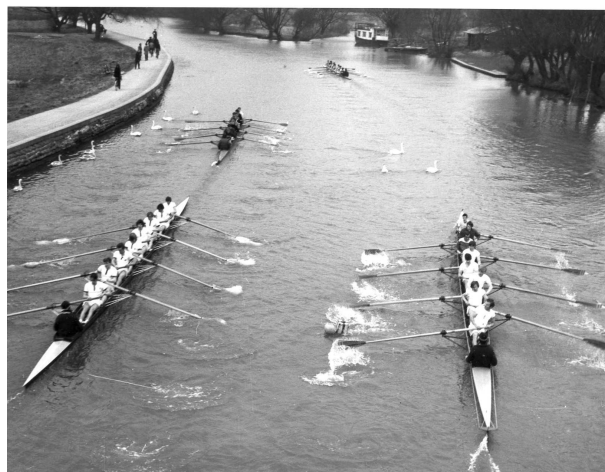
Torpids in 1969 with the St Catherine's 1st Torpid in the lower left. Note the lane marker in the lower centre. Note also the casual (and mutual) disregard of swans in the racing line.