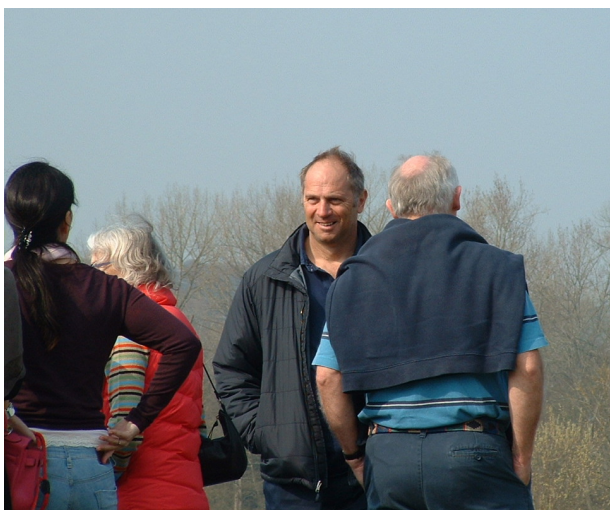
An anxious parent waits on the bank during the Henley Boat Races, although you don't get 5 Olympic gold medals without learning a bit about how to stay relaxed.