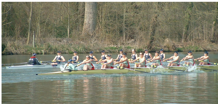
Oxford (far side) with a narrow lead over Cambridge half-way through this year's Women's Boat Race.