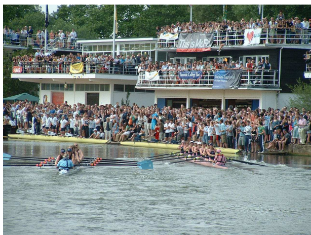
Some interesting steering in W.Div I as Wadham pursue Pembroke and somehow fail to bump them, or indeed any of the M.Div I boats already set out on the rafts.