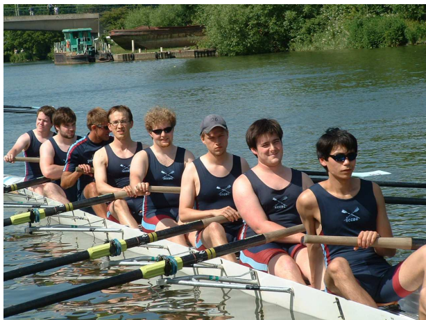
The Men's 2nd Eight (mostly) looking relaxed on the bungline on Friday.

For M1 it has been a bumpy ride this term in many ways. We lost rowers from last term to exams, field trips and eligibility. We trained and trialled rowers from M2, so for the first few weeks our line-up was less consistent than what would have been ideal. Things settled down as Summer Eights drew close... until we hit a punt 3 days before racing. Pembroke were kind enough to lend us a 90's Empacher, it took some hours to get it into a rowable state, but we were pleased we had a boat with a bow attached. During Eights I know everyone gave 110%, but sometimes there is no escaping the crew behind. At no