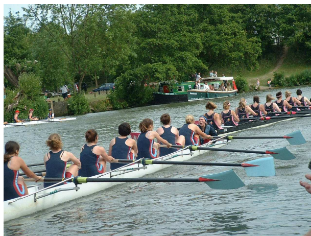
The Women's 1st Eight getting into a spot of bother with Worcester on the Saturday.