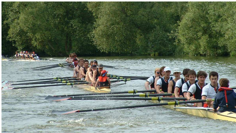
The Men's 1st Eight racing on the Saturday (centre), with Balliol closing!