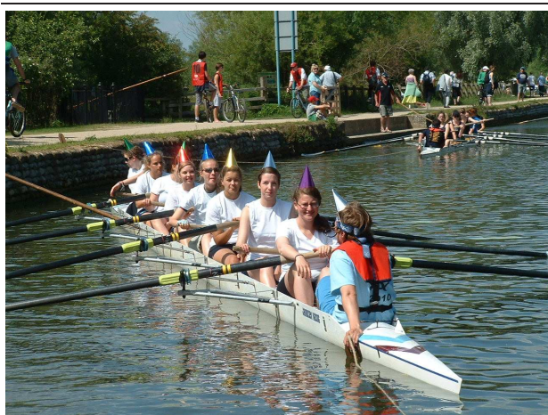
The Women's 2nd Eight on the bungline on Friday. (It was no.3's birthday, hence the hats).

The 1st Eight began well, rowing over twice on the first two days. Unluckily on the third day, they clipped the bank just before achieving the bump on Somerville, allowing Wolfson