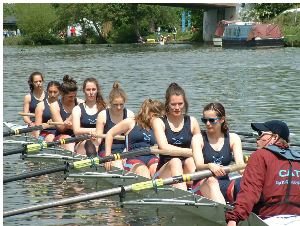
The Women's 2nd Eight at the start on Saturday.