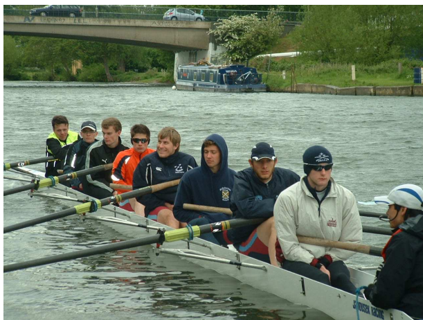
'Tell me again: what was the attraction of racing in Summer Eights ?' Catz Men's 2nd Eight keeping warm before Friday's start.